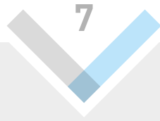
6pm Group Malta