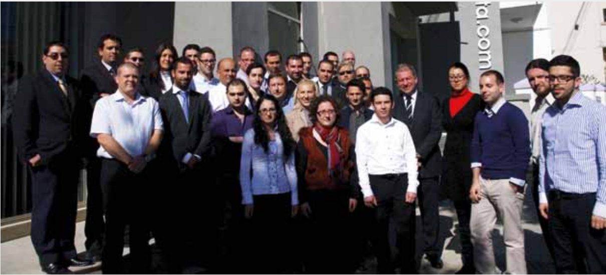
6pm Group Macedonia